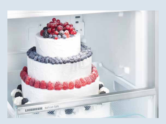
VarioSpace: The freezer includes include drawers and glass shelves that can be conveniently removed to create extra storage space. It's Liebherr's very practical solution to quickly accommodate even bulky items.

Volume, efficiency, economy, ease of use, and outstanding design are the key features of the SGNPbs 4365 BlackSteel freezer from Liebherr's BluPerformance series. Highquality components and materials, and perfect workmanship combined with precise touch electronics system are what made this appliance so efficient.