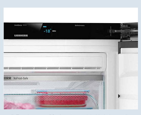
2.4" Touchscreen Display: Located behind the appliance door, this high-resolution and high-contrast 2.4" touchscreen display can be read from any angle. Stored menu options are Intuitive and easy-to-operate.