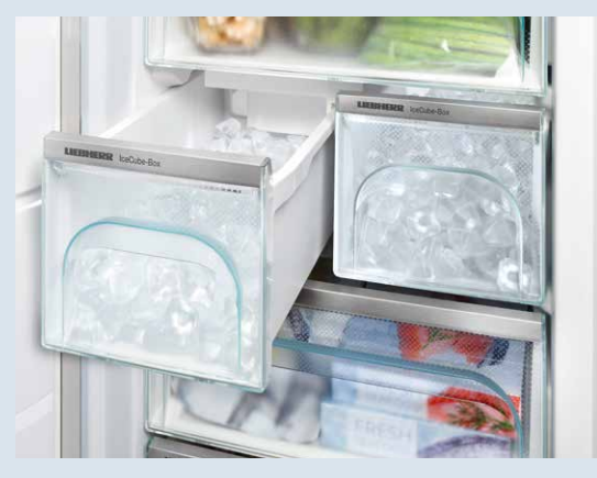
IceMaker: Liebherr's automatic IceMaker produces flawless crescent ice and keeps a constant supply on hand for every occasion.