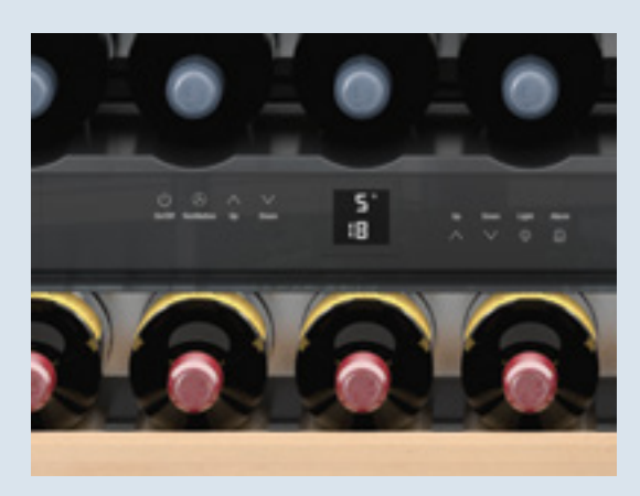
Electronic LCD Display : Intiuitive navigation of touch electronic control system enables tailored storage options. The digital temperature display can be viewed via the UV tinted glass door.