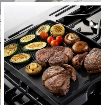
Optional extra griddle plate Not included standard