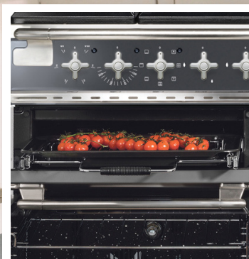
Slide out grill