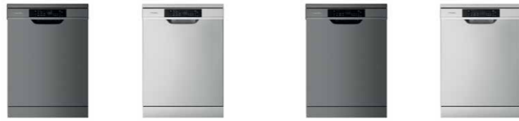
WSF6608KXA / WSF6608XA WSF6606KXA / WSF6606XA