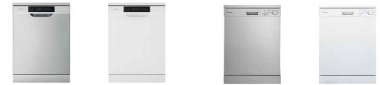
WSF6604XA / WSF6604WA WSF6602XA / WSF6602WA