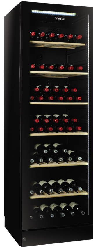
170 Bottle Wine Cabinet V190SG2E-BK