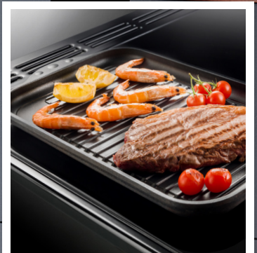
Bridging zone with griddle plate Induction hobs only