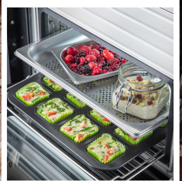
Dedicated steam oven